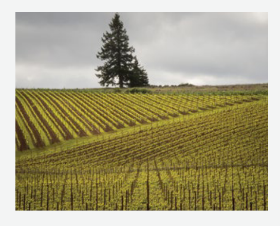
A pioneer cemetery came with the purchase, adding to its potential other world quality.

Spirit Hill Vineyard draws on Argyle's experience in higher elevation fine wine grape growing.