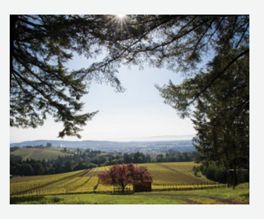
This is Argyle's home for Spirithouse Pinot Noir and our single-vineyard designated Argyle Blanc de Blancs.

Knudsen is the home the America's first commercial planting of Dijon Clone Chardonnay.